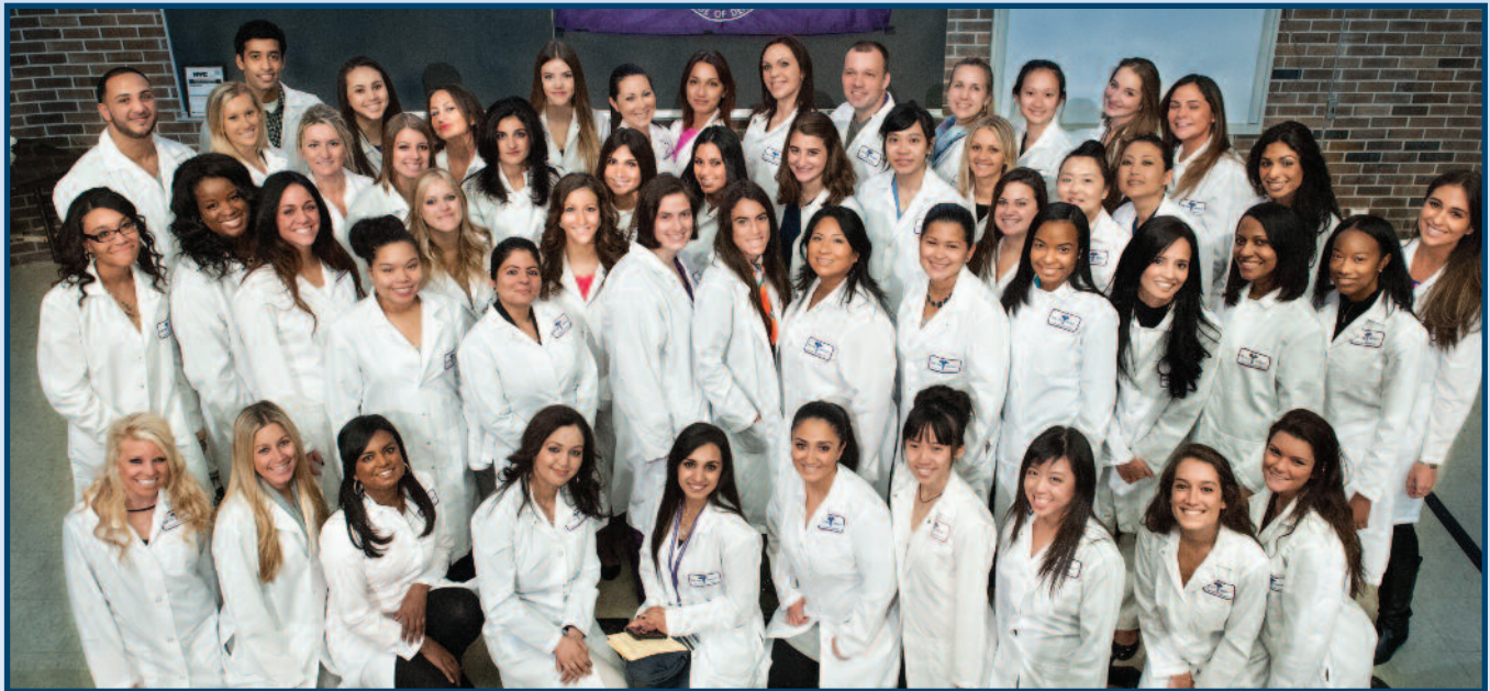
A recent White Coat Ceremony for dental hygiene students.

program. Because it is an integral part of NYUCD, the dental hygiene program enables students to work collaboratively with second-, third-, and fourth-year DDS students and to rotate among the specialties.