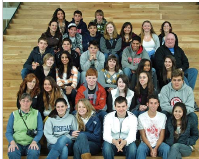
Opposite page: Gullfoss; This page top: Gullfoss; Bottom: All participants in the Unit trip to Iceland.